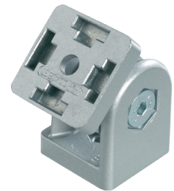
Optional mounting hinges for Typhoon airknife.