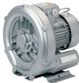
Powerfull but compact blower for the Typhoon airknife. Supplies filtered air to the airknife