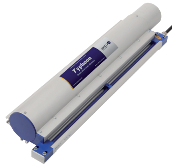
Typhoon with EP-Sh-N anti-static bar