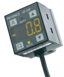
An optional airpressure sensor can measure the air pressure inside the airknife. If the pressure drops under the required level, the system does not work optimal. A system check is then necessary, often it appears that the air filter needs to be cleaned.