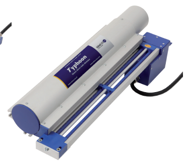
Typhoon with P-Sh-N-Ex anti-static bar