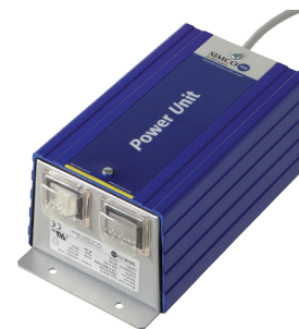
A2A7M Power Unit with 12V connection for the pressure sensor